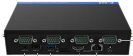
LINE OUT USB3.0 TF & SIM HDMI LAN DC IN