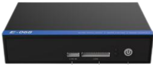
LVDS_BK LVDS POWER